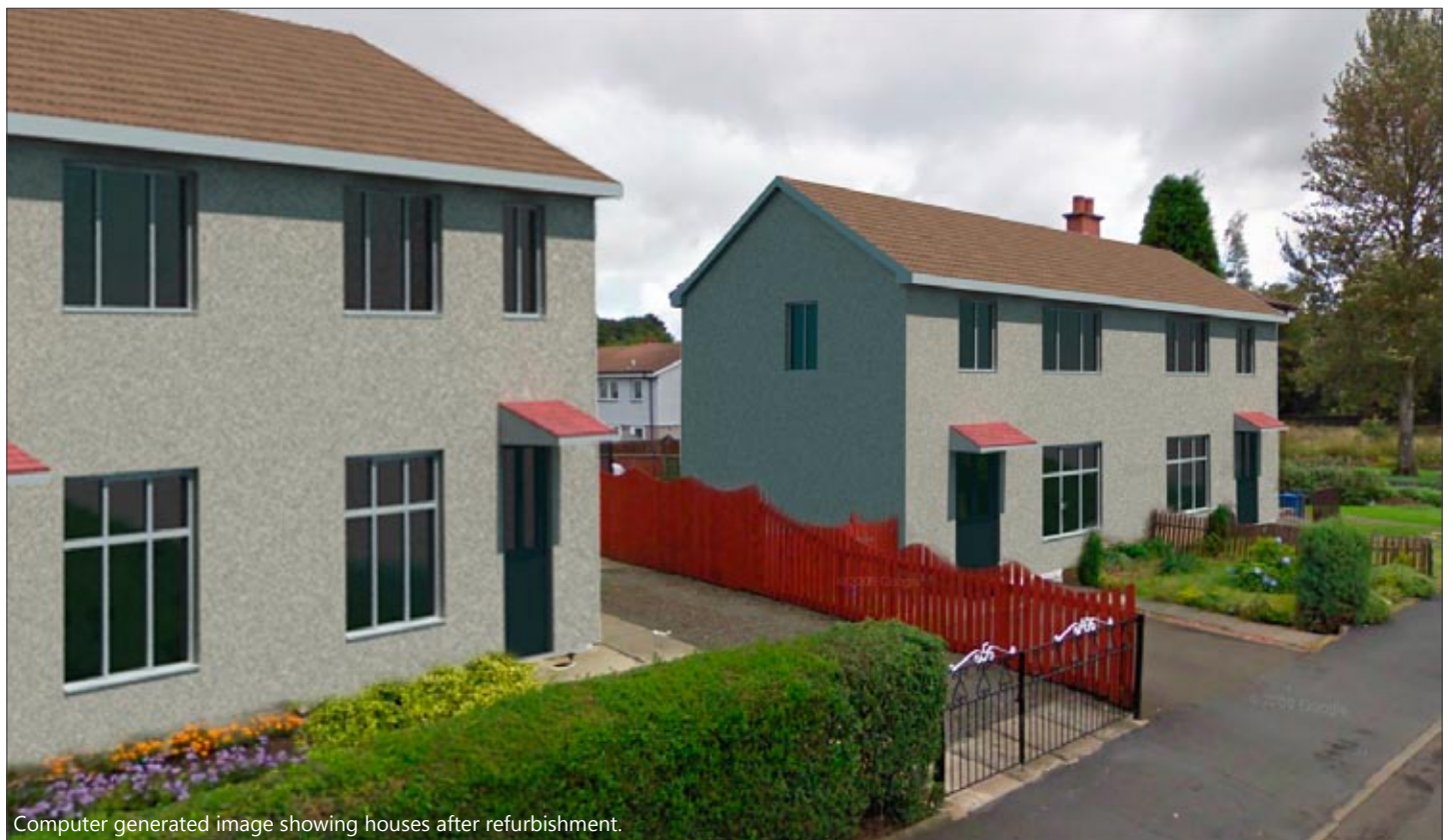
Computer generated image showing houses after refurbishment.